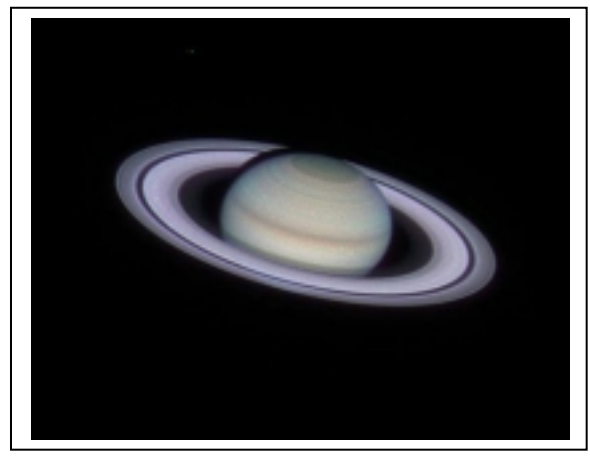
Saturn is visible after dark