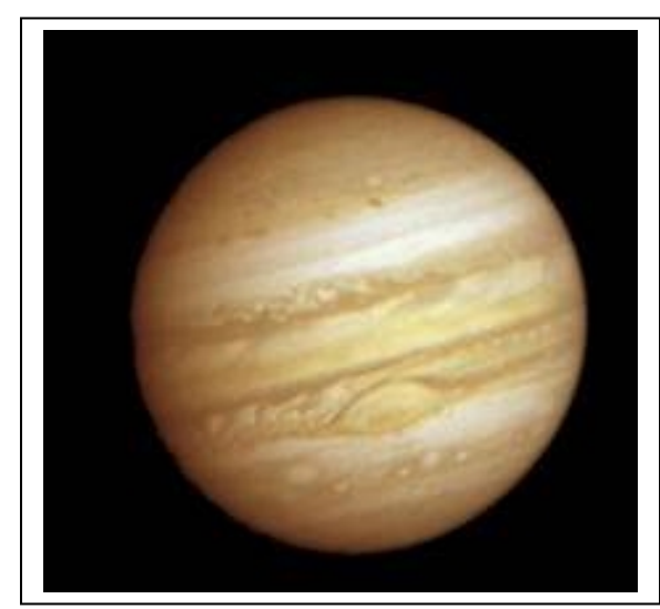
Jupiter is visible after 10:00