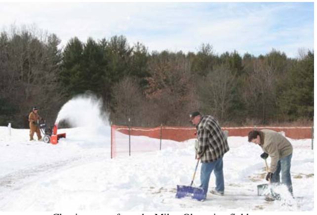
Clearing snow from the Milon Observing field.

Big thanks to Tal Mentall for the donation of a second snow blower at a critical time. The big blower caught a large stone and later sheared a pin while the little blower chugged on. Also, thanks to Dave Aguilar for the box of astronomical parts delivered by Dick Koolish; and to Tom Calderwood for the 2008 calendar.