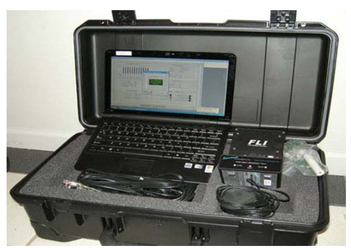
PICO system.

Paul Valleli described the PICO system (Portable Instrument for Capturing Occultations), which fits into a ruggedized carry-on case system that the ATMoB teams used. The camera, made by Finger Lakes Instruments, has a 512x512 CCD chip with a 3-stage Peltier cooling that can lower the chip to 70 degrees Celsius below the ambient temperature. There is essentially no electronic dark noise. The camera can take a 2/10<sup>th</sup> of a second exposure. The computer is a Lenovo netbook with a lot of RAM memory and running on Windows XP. The GPS unit is designed to send pulses through the computer to the camera. The camera is designed to receive them and that is what sets the cadence and exposure time. The camera and computer can take up to 8/10ths second so data can be acquired every second.