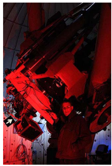
Bruce Berger next to the 1.5-meter San Pedro Martir Observatory scope.

During the morning of the occultation the weather was perfect and he collected 2,500 images at 1.5 second intervals. Unfortunately he was too far north of the updated prediction and missed the occultation.