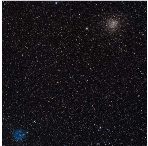
IC 1295 and NGC 6712.

This little-known planetary nebula was discovered by American astronomer/mathematician Truman Henry Safford on August 28, 1867. Its listed magnitude of 12.7 might cause backyard astronomers to shy away, but IC 1295 has a high surface brightness and may be glimpsed from dark-sky locations with telescopes as small as 6 inches in aperture. An OIII filter and moderately high magnification are essential if you want to visually detect IC 1295, let alone pick out any detail. A bonus is the presence, just 0.4 degrees west-northwest, of the 8th magnitude globular cluster NGC 6712.