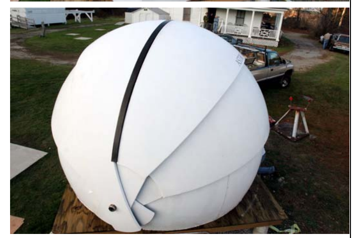
For Sale ...

Stellarvue AT-1010 80 mm f/6 refractor. Includes 2" Williams Optics diagonal, GSO 2 speed focuser, rings, plate, and red dot finder.