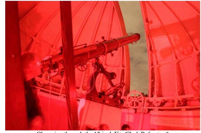
Observing through the 12-inch Fitz/Clark Refractor.*

Very impressive. I felt like I was stepping back in time. That was the general feeling of the 40+ club members and their guests the evening of Saturday, April 26<sup>th</sup> after they toured the Whitin Observatory (pronounced white' in) at Wellesley College, which has a long and prominent history in the field of Astronomy. Details about Astronomy at Wellesley College and the Whitin Observatory can be found at <u>http://www.wellesley.edu/astronomy</u>.