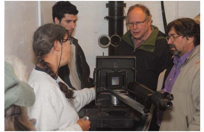
Hale spectrohelioscope. *

The Hale spectrohelioscope, installed in 1934. Sunlight, directed by a heliostat housed in a small aluminum dome on the roof, beams down through a vertical brass tube to the instrument in the basement. More than one person was overheard announcing appreciatively "This is going to be my next project."